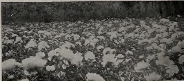
2,000 Festiva Maxima

No hardy perennial is of more permanent value than the Peony. The first cost is the only cost, and they continue to increase in size and value for many years. The foliage is rich and of beautiful deep green color, which renders the plant very ornamental even when out of flower, and few other flowers are so well adapted for interior decoration and none make more massive color effect when planted in a border or in a bed on the lawn. Their popularity has increased during the past few years since the new improved varieties have been disseminated. Peonies range in color from cream and pure white through the various shades of pink and red to the deepest purple and maroon, in all possible combinations of tint and form.